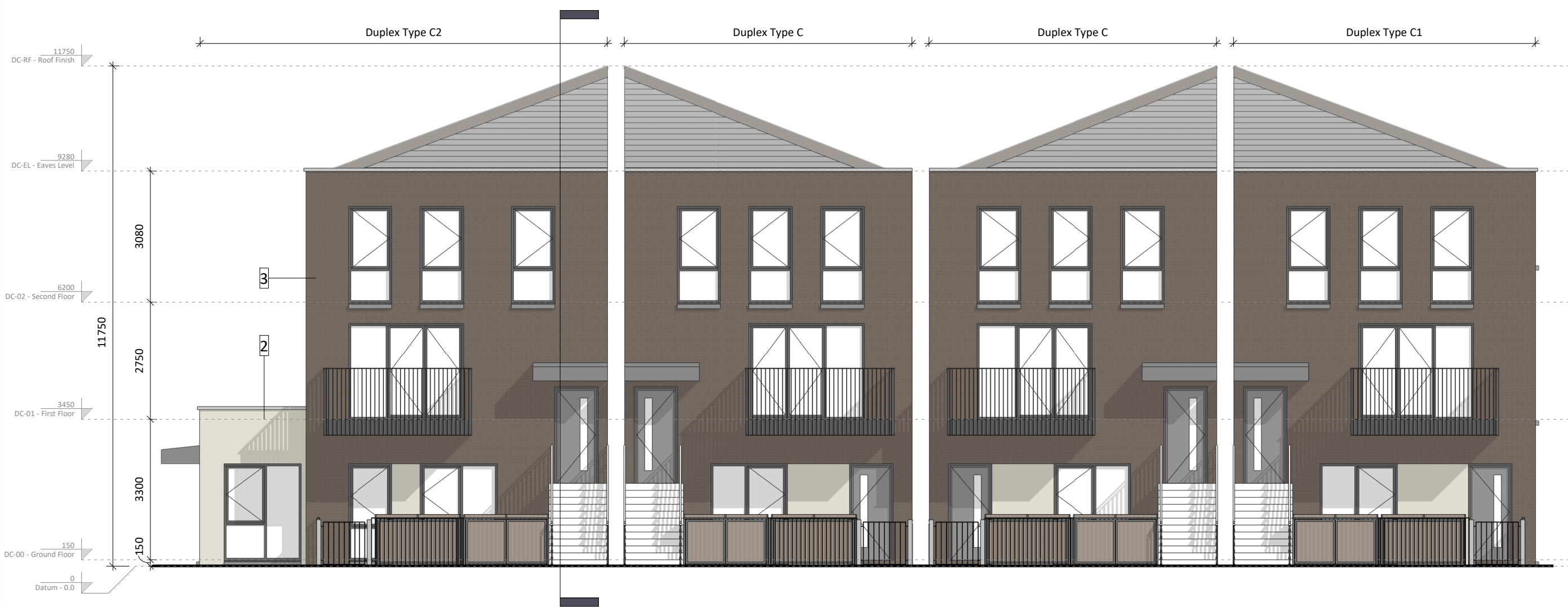
① DC - Front Elevation 1:100