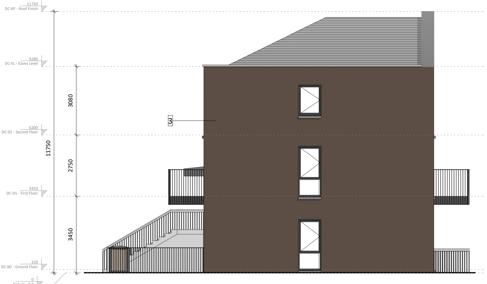
④ DC1 - Gable Elevation 1:100