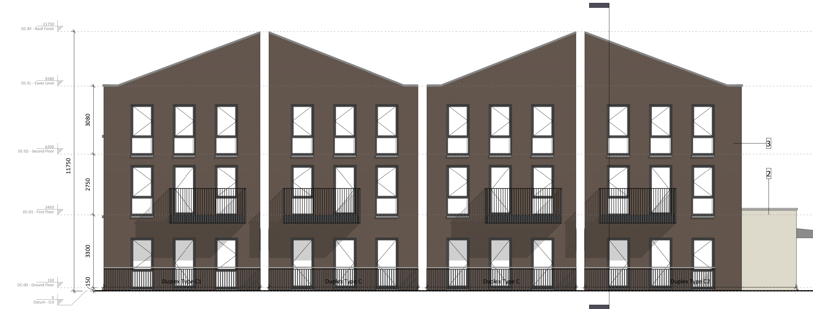
③ DC - Rear Elevation 1:100